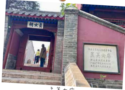
孟姜女庙 Meng Jiangnu Temple