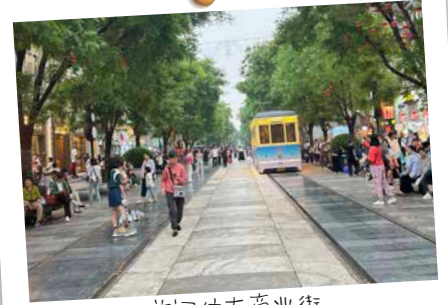
前门仿古商业街 Qianmen Pedestrian Street