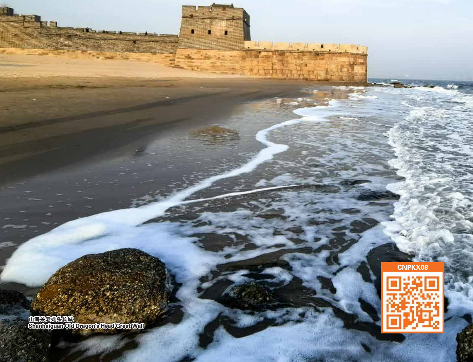
山海关龙头长城 Shanhaiguan Old Dragon's Head Great Wall

唐山 | 秦皇岛 | 天津 TANGSHAN | QINHUANGDAO | TIANJIN