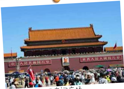
天安门广场 Tiananmen Square