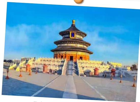
天坛 / Temple of Heaven